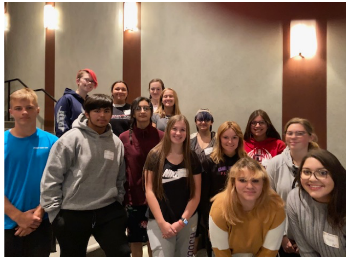
Pictured above are Clarkson/Leigh high school choir students who attended the Midland University Acapella Honor Choir.

December 16th - Clarkson-Leigh JH and HS Christmas Program at 7:00 p.m. in Leigh